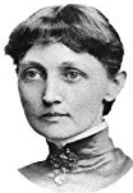
Emma Curtis Hopkins

Click link bellow and free register to download ebook: SPIRITUAL LAW IN THE NATURAL WORLD BY EMMA CURTIS HOPKINS